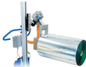
Expand&Turn - pneumatic expander, turning operated electrically