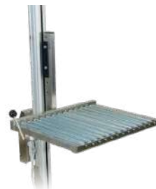
Roll platform, with side-feed