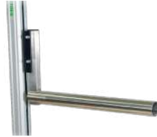
Prong for roll handling