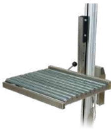
Roll platform, with front-feed