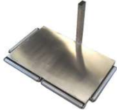
Platform with edge rolls

Select an accessory you require from our broad range of standard tools: prong for roll handling, roll platform, lifting forks, as well as our Squeeze&Turn modules; weighing scales and counting scales, etc. We also manufacture customized tools in accordance to your specifications.