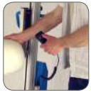
Detachable manual control box

To ensure maximal safety the trolley possess a built-in release function, which serves as protection from crushing injuries and prevents the trolley from tipping over.