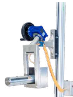
Expand&Turn - pneumatic expander, turning operated manually

Flexibility - choose mast height, and width & length of legs