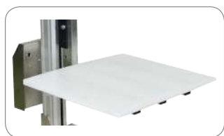
Standard platform. For cartons , boxes, crates, etc. 560x440mm Article.no. 15338+15322

Apart from the standard platform, there are a number of other standard accessories available.