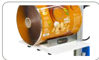
V Block and turntable. Perfect for reel handling. Rotatable 360° Article.no.17229 + 17233