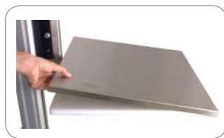
Top plate in stainless steel(442x498mm) Can be placed on top of the plastic platform. Article.no.15018