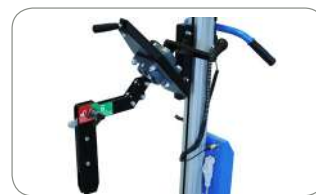
Expand&Turn Light. Designed to handle 3" (76mm) reels in the core. Article.no.17940