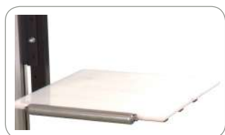
Edge Roller. Length 300 mm Article.no. 15026A