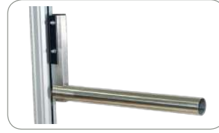
Prong for roll handling. Tool for lifting rolls in the core. Length 500mm Ø60.3mm Article.no.17241