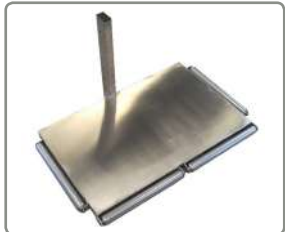
Platform with edge rolls