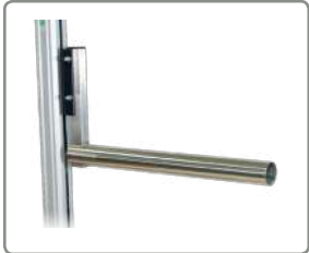
Prong for roll handling

We have a large number of standard tools such as load platform, forks, control and counting scale and Squeeze&Turn and our pneumatic expandable Expand& Turn. We also manufacture customized tools in accordance to your specifications.