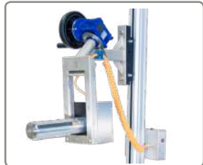
Expand&Turn - Pneumatic expander, turing operated manually