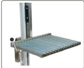
Roll platform, with side-feed