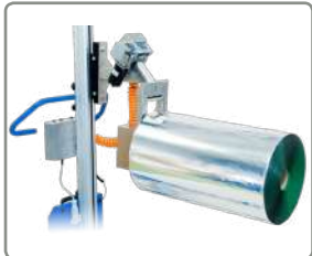
Expand&Turn - Pneumatic expander, turing operated electrically